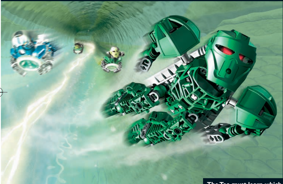
The Toa must learn which of the six Matoran is planning to betray the city.